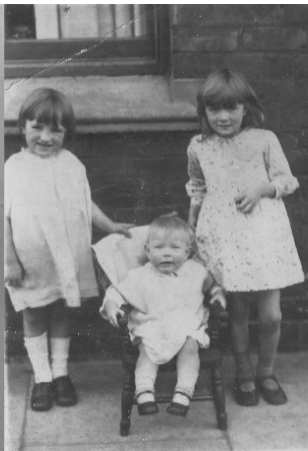
The siblings + one